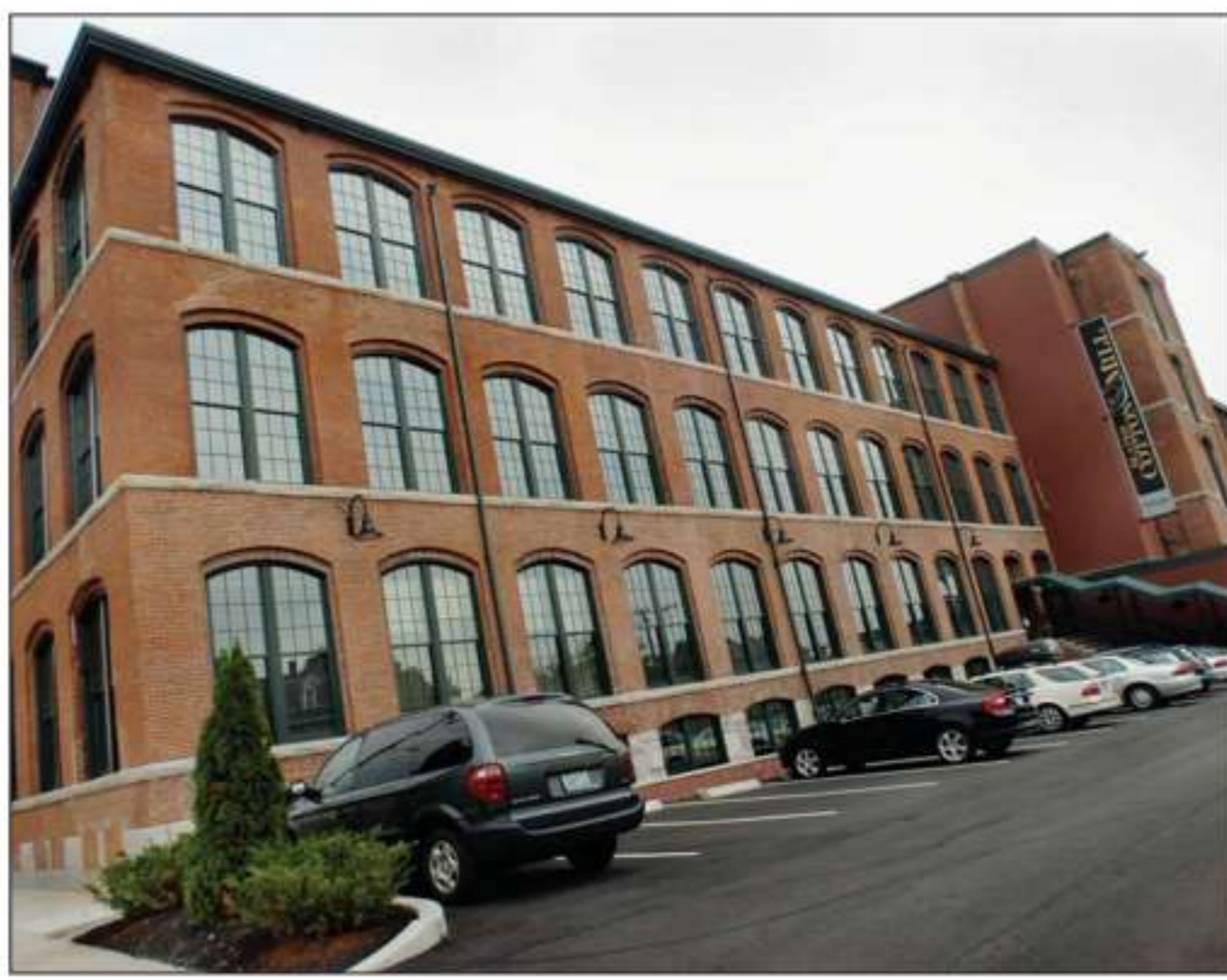
Top, a view of the living room in a one-bedroom unit. Middle right, Above, the exterior of the Slater Cotton Mill apartments, located at 75 South Union Street in Pawtucket, from the South Union Street side of the apartment complex.