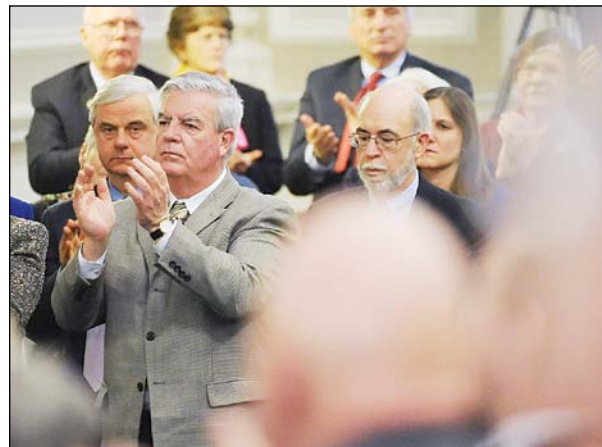
State politicians applaud as Gov. Maggie Hassan presents her State of the State address in Representatives Hall at the State House on Thursday.